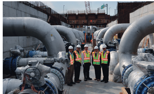
Skyway Wastewater Treatment Plant upgrade

Weather patterns have changed over the past few decades with more intense storms such as the December 2013 ice storm and the August 2014 flood. Such events highlight the need to continuously review and identify improvements in Halton's emergency planning and response. The 2015 Budget includes $5.0 million to assist in the implementation of any recommendations of the Region-wide Basement Flooding Mitigation Study, as well as $5.5 million towards emergency generators in warming and reception centres and $378,000 to increase the Region's capacity to respond to emergencies.