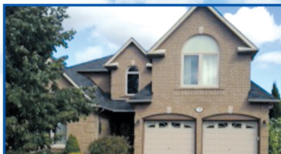
EXECUTIVE HOME GEORGETOWN SOUTH! $714,500