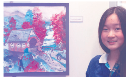
Celebrating Youth 4-page section inside