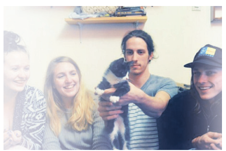
Toronto tragedy with Georgetown connection, pg. 3