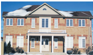
172 Miller Drive, Georgetown Sunday, March 9, 2:00-4:00 $608,000

Open Houses This Weekend Full listing details available at: www.johnsonassociates.ca