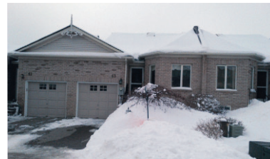
47 Atwood Avenue, Georgetown Sat, Mar.8 & Sun, Mar.9, 2:00-4:00 $399,000