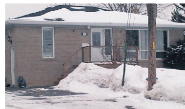
31 Norton Crescent, Georgetown Sat, Mar.8 & Sun, Mar.9, 2:00-4:00 $429,900