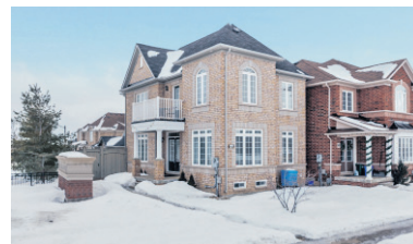
14500 Danby Road, Georgetown Sat, Mar.8 & Sun, Mar.9, 2:00-4:00 $465,000