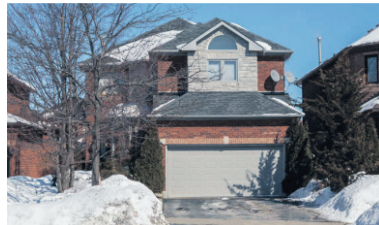
6 Miller Drive, Georgetown Sat, Mar.8 & Sun, Mar.9, 2:00-4:00 $619,000