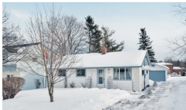
9 Water Street, Erin Sunday, March 9, 2:00-4:00 $289,900