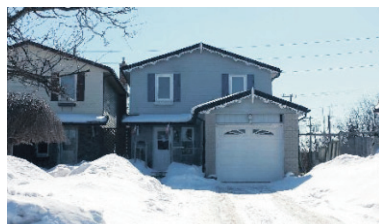
84 Danville Avenue, Acton Sunday, March 9, 2:00-4:00 $339,900