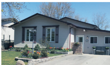
548 Woodward Avenue, Milton Sat, Mar.8 & Sun, Mar.9, 2:00-4:00 $474,900