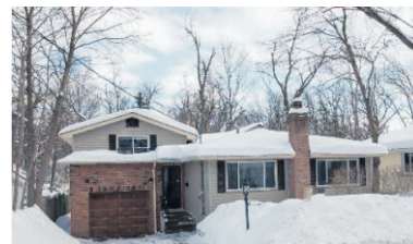
40 Park Avenue, Georgetown Sat, Mar.8 & Sun, Mar.9, 2:00-4:00 $429,900