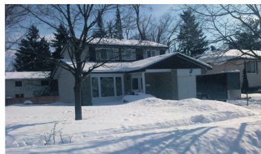
27 Division Street, Acton Sunday, March 9, 2:00-4:00 $429,000