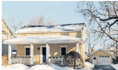
86 Mill Street, Milton Sunday, March 9, 2:00-4:00 $549,900