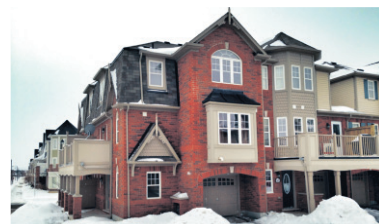
801 Fowles Court, Milton Sunday, March 9, 2:00-4:00 $359,900