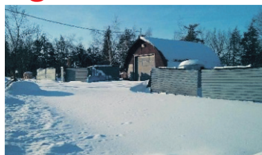
.40 ACRE INDUSTRIAL LOT $349,500