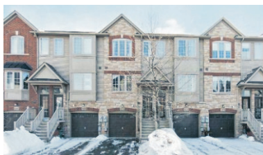
EXECUTIVE FREEHOLD TOWNHOME $369,900