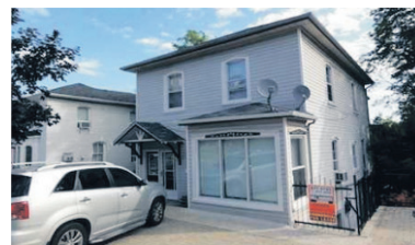
BASEMENT LEVEL - DOWNTOWN GEORGETOWN $500/Month