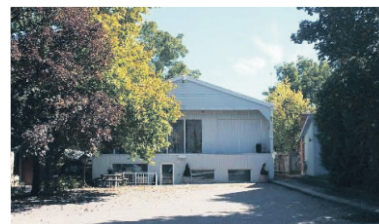
DO NOT MISS THIS OPPORTUNITY! $16.00 Per Sq.Ft.