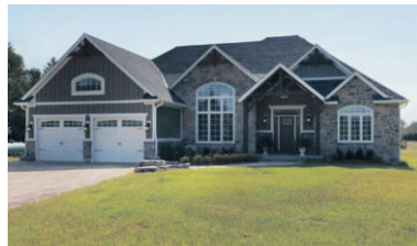
5924 Fourth Line, Erin Sunday, March 9, 2:00-4:00 $949,000