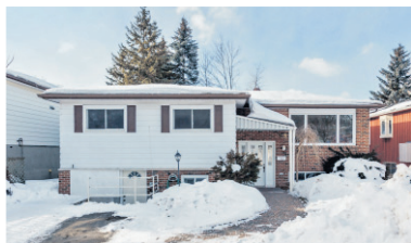
73 John Street, Georgetown Sat, Mar.8 & Sun, Mar.9, 2:00-4:00 $399,900