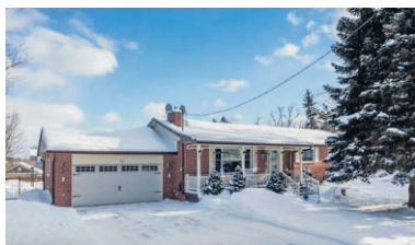
7 Coles Court, Acton Sunday, March 9, 2:00-4:00 $594,900