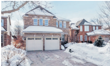
52 Standish Street, Georgetown Sunday, March 9, 2:00-4:00 $775,000

Valerie Keslick**/haltonhomes.com 14-059 W2844323