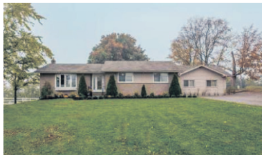
9408 Seventeenth Sideroad, Erin Sunday, March 9, 2:00-4:00 $979,000