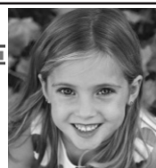
New Patients & Emergencies Welcome!