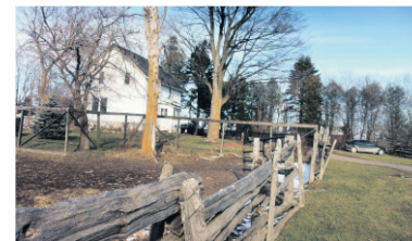
CENTURY HOME - 19 ACRES! BARN! ARENA! SHED! $649,000

13-518 www.RichardsonTownandCountry.ca X2796105