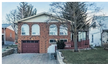
3 BDRM RAISED BUNGALOW IN A GREAT LOCATION $315,000

Johnson Associates Open House Tour Plan your weekend – when and where to attend the most desirable open houses: www.johnsonassociates.ca