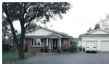
3 BEDROOM BACKSPLIT - WOW! $629,900