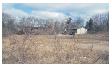
OPPORTUNITY KNOCKS - 1.3 ACRES IN TOWN $650,000

13-520 www.chooseacordingley.com W2797048