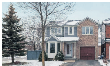
ONE OF THE LARGEST YARDS ON THE STREET!