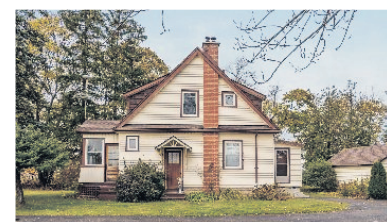
COUNTRY HOME ON LRG LOT, ESCARPMENT VIEWS $449,000

13-493 www.RichardsonTownandCountry.ca W2776385