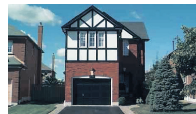
BEAUTIFUL DETACHED & AFFORDABLE IN MEADOWVALE $459,800