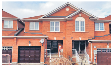
STUNNING 3 BEDROOM FREEHOLD TOWNHOME $374,900

13-514 www.chooseacordingley.com W2793827