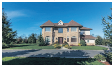
RURAL/NEWER CONSTRUCTION $1,195,000