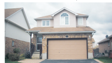
GREAT FAMILY NEIGHBOURHOOD $437,900