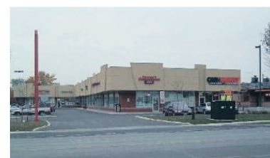
GREAT EXPOSURE $2,700/Month