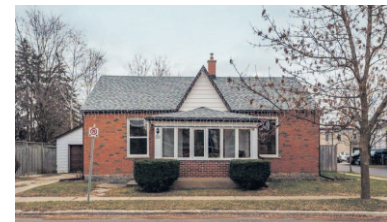
VIRTUAL TOUR @ www.willsell.ca $319,000

13-518 www.RichardsonTownandCountry.ca X2796105