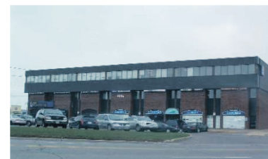
VERY SOUGHT AFTER LOCATION - 4 UNITS AVAILABLE! $500-$1000/Month