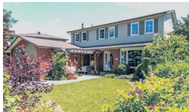
41 Mary Street, Georgetown Saturday, December 21, 2:00-4:00 $599,900

Full listing details available at: www.johnsonassociates.ca