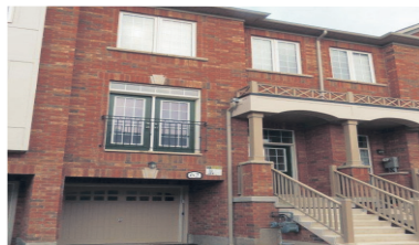
WEAVERS MILL EXECUTIVE TOWNHOME $389,900

13-514 www.chooseacordingley.com W2793827