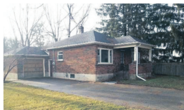
CLEAN & BRIGHT BUNGALOW FOR LEASE $1,550/Month

13-524 www.realestatethatmovesyou.ca W2800080