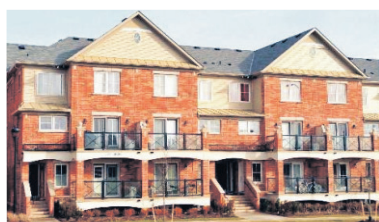
SOUGHT AFTER PRESTIGIOUS COMMUNITY $1,600/Month

13-520 www.chooseacordingley.com W2797048