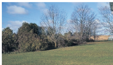
BEAUTIFUL VIEWS $1,100,000

13-493 www.RichardsonTownandCountry.ca W2776385