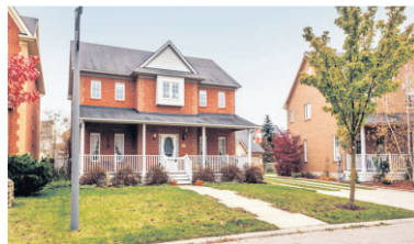
COUNTRY CURB APPEAL IN ROCKWOOD! $467,500