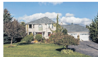
GRAND COUNTRY HOME $624,900