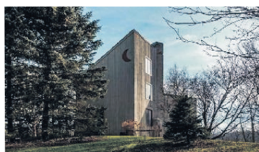
8+BEAUTIFUL ACRES IN A SOUGHT AFTER AREA $592,500