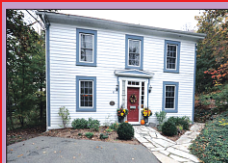
LANDMARK RESIDENCE IN SCENIC GLEN WILLIAMS - $674,900

On a breathtaking 1/2 acre property, enjoy Credit River views from this magnificent Century home done to perfection with no detail overlooked and no expense spared. 2 cabins nestled into the stunningly landscaped grounds add historical charm and ambience to this incredible offering. All the charm of yesteryear with original doors/floors/trim etc. yet exquisitely upgraded/updated with today's living comforts and standards in mind. Open concept kitchen with bar, dining room, formal living room and an impressive family room with focal fireplace. Handy mud room and 2pc bath. Spacious bedrooms with generous closets and everything decorated to the nines. Get rid of the cottage and enjoy spectacular views every day in this quaint and desirable location. Call us for complete details and a personal viewing.