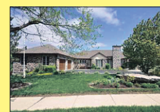
BEYOND IMPRESSIVE CUSTOM BUILDER'S RESIDENCE - $764,900

Desirable end unit with garage, 3 bedrooms, 2 baths, large bi-level deck and fenced yard. Fully renovated, open concept design and features a gorgeous brand new Maple kitchen with ceramic floor and quality new appliances including dishwasher. High end laminate floor on main level and plush broadloom upstairs. Freshly painted in modern colours. For extra living space the basement has been drywalled, painted and awaiting your finishing touches. Excellent location in a family friendly area and close to go station, shopping and parks. Immaculate move-in ready home. Quick possession is available. Call us before it is gone.