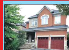
FABULOUS FLOOR PLAN WITH RESORT YARD IN STEWART'S MILL - $649,900

Set on a spectacular, out of this world oasis yard with showstopper waterfall, pond, glorious gardens, massive deck, armour stone and interlock steps/walkway. Modern open concept design, beautifully decorated in chic designer colours and loaded with quality upgrades including brand new handscraped hardwood on main floor & crown mouldings in all principal rooms and upper hall. Lovely kitchen with extended height Maple cabinets, centre island, and pantry. Gorgeous family room with dramatic Cathedral ceiling & gas fireplace. Lots of pot lights & upgraded lighting fixtures thruout house. Solid hardwood staircase leads to 4 generous size bdms including a Master retreat with vaulted ceiling, a spa-like 5 pc ensuite bath & walk-in closet. Call us for details and a personal viewing.