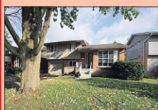
DESIRABLE MATURE TREED AREA IN A GREAT CENTRAL LOCATION - $384,900

On a breathtaking 1/2 acre property, enjoy Credit River views from this magnificent Century home done to perfection with no detail overlooked and no expense spared. 2 cabins nestled into the stunningly landscaped grounds add historical charm and ambience to this incredible offering. All the charm of yesteryear with original doors/floors/trim etc. yet exquisitely upgraded/updated with today's living comforts and standards in mind. Open concept kitchen with bar, dining room, formal living room and an impressive family room with focal fireplace. Handy mud room and 2pc bath. Spacious bedrooms with generous closets and everything decorated to the nines. Get rid of the cottage and enjoy spectacular views every day in this quaint and desirable location. Call us for complete details and a personal viewing.