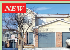
NEW A FABULOUS STARTER HOME - $279,900

Spacious 4 level sidesplit has been upgraded/updated and decorated in chic designer colours. Features dark hardwood throughout, new interior doors, upgraded trim and lots of pot lights. Stunning kitchen with rich dark cabinetry with crown mouldings on top and lighting valance under cabinets and a beautiful pantry/desk combo in dining room area. Fully renovated main bathroom with soaker tub, new ceramics and a large counter with lovely vessel sink. Main floor family room, additional 3pc bath and walkout to patio and a lovely private fenced yard. Finished basement has a bright and stylish rec room with cozy broadloom and lots of pot lights. This home is immaculate and move-in ready.