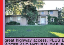
GORGEOUS .45 ACRE ESTATE LOT AT EDGE OF TOWN $539,900

Set on a spectacular, out of this world oasis yard with showstopper waterfall, pond, glorious gardens, massive deck, armour stone and interlock steps/walkway. Modern open concept design, beautifully decorated in chic designer colours and loaded with quality upgrades including brand new handscraped hardwood on main floor & crown mouldings in all principal rooms and upper hall. Lovely kitchen with extended height Maple cabinets, centre island, and pantry. Gorgeous family room with dramatic Cathedral ceiling & gas fireplace. Lots of pot lights & upgraded lighting fixtures thruout house. Solid hardwood staircase leads to 4 generous size bdms including a Master retreat with vaulted ceiling, a spa-like 5 pc ensuite bath & walk-in closet. Call us for details and a personal viewing.