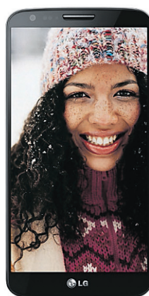
LG G2 superphone

$99 95 2-yr. term with Voice & Data Plus plan $699.95 No term