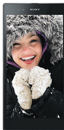
Sony Xperia ® Z Ultra superphone

$99 95 2-yr. term with Voice & Data Plus plan $799.95 No term