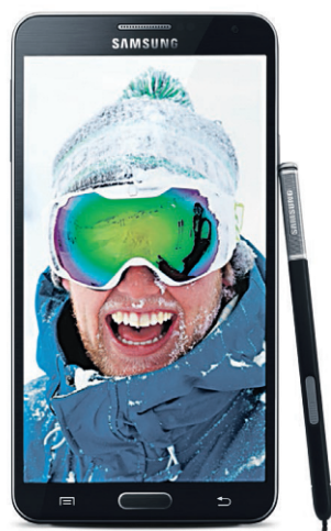
Samsung Galaxy Note 3 ™ superphone

Get expert advice when you shop at Bell. There's never been a better time to get on Canada's largest LTE network!