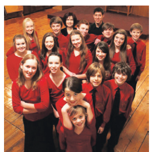
GAUDEAMUS SENIOR CHOIR

Hear Stories of Christmas from the well-travelled youth of Gaudeamus Choirs at this year's Christmas concert. The program, complete with the ensemble's standard offering of excellent choral music accompanied by presentations of Christmas stories and traditions from around the world, is guaranteed to put you in the holiday spirit. The concert takes place on Saturday, Nov. 30, 7 p.m. at St. John's United