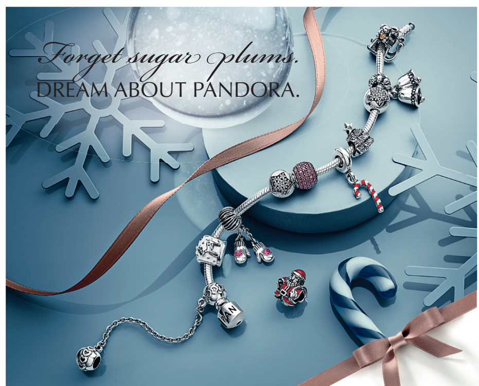
Sterling silver charms from $29