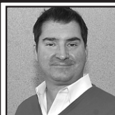
By Cory Soal R.H.A.D.

Please contact us as soon as possible if you have any accessibility needs at Halton Region events or meetings.