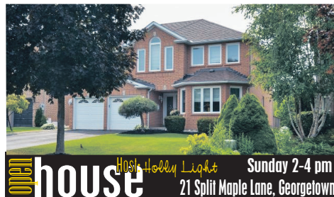
Info house Host: Holly Light Sunday 2-4 pm 21 Split Maple Lane, Georgetown

Picture Your Family in this spotless 4 bdrm, 4 bath detached home located on a premium lot in desirable Georgetown South. With over 3,600 sq.ft. of luxurious living space! Combined Living/ Dining Rm with French doors, a large picture window with California shutters. Main level Family Room with natural hardwood flooring, vaulted ceiling & gas f/p. Family-sized eat-in Kitchen with all the bells & whistles - with W/O to a massive deck. Master with 6 pc ensuite, W/I closet & California shutters. 3 other ample bdrms all with double closets share the main 4 pc bath. Huge finished basement with 2 rec spaces, a workshop, gas f/p, pot lights, 3 pc bath & W/O to an 1/6 pool, pool house with hydro, interlock patio & tons of privacy! $689,900.00 Georgetown MLS#W2734801