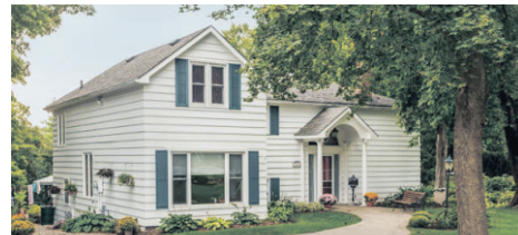
Info house Host: Jennifer Sargeant Sunday 2-4 pm 311 Maple Ave, Georgetown

Sanctuary! The creatures of the forest & your family will feel free & secure in this serene 1.34 acre private world that's just a 5 min walk to Downtown Georgetown shopping, restaurants, theatre & library. You will fall in love with the park-like backyard - gorgeous 1/6 pool surrounded by perennial gardens & majestic trees. This residence offers approx 3,600 sq.ft. of living space! Kitchen - oak cabinets, granite counters & massive breakfast bar. Dining area has W/O to deck overlooking pool & manicured lawns. Living Rm with picture windows & gas fireplace - Family Rm just off Kitchen. Master with W/O to private patio, 4 bdrms share main 5 pc bath. Finished bsmt - B/I entertainment centre, gas f/p & W/O's to patio & pool. $949,900.00 Georgetown MLS#NEW