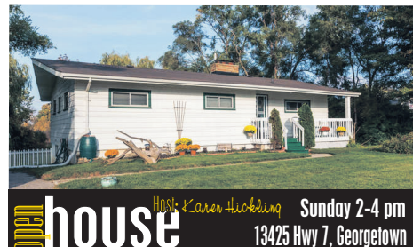
Info house Host: Karen Hickling Sunday 2-4 pm 13425 Hwy 7, Georgetown

It's Sitting Pretty! This 3 + 2 bdrm & 2 bath detached bungalow is located on a serene 1/2 acre country lot! Natural light fills this home from top to bottom. Bright & spacious open concept Living & Dining Rm features crown moulding, lrg windows & W/O to massive deck that overlooks the expansive backyard & open fields! Kitchen with ceramic floors, lrg window & B/I DW. 3 generous bdrms large windows, closets & ceiling fans share the main 4 pc bath. Finished bsmt including separate entrance - ideal for nanny suite - includes Rec Rm with ceramic floors, pot lights, lrg windows with California shutters, W/O to patio area, 2 extra bdrms & 3 pc bath. Enjoy the privacy of country living but only mins away from town amenities! $439,900.00 Georgetown MLS#NEW