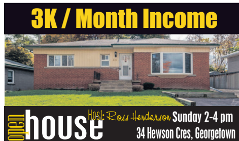
Info house Host: Ross Henderson Sunday 2-4 pm 34 Hewson Cres, Georgetown

Let The Tenants Pay The Mortgage! This 3 unit home is a great investment opportunity. Unit 1 offers sun-filled Living Room with picture window & crown molding, spacious eat-in Kitchen, 2 generous bedrooms with laminate flooring, large window & a 4 pc. bath. Unit 2 offers a spacious Living/Dining Room with laminate & W/O to lower deck, Kitchen, loft bedroom with W/O to balcony & ensuite access to the 4 pc. bath. Unit 3 is on lower level & has been completely renovated. Laminate flooring, A/G windows & pot lights throughout, open concept Living area, Kitchen, large bedroom & 3 pc. bath. With a huge backyard & paved parking for 5 vehicles, enough space for everyone. Don't let this investment pass you by! $444,900.00 Georgetown MLS#W2767617