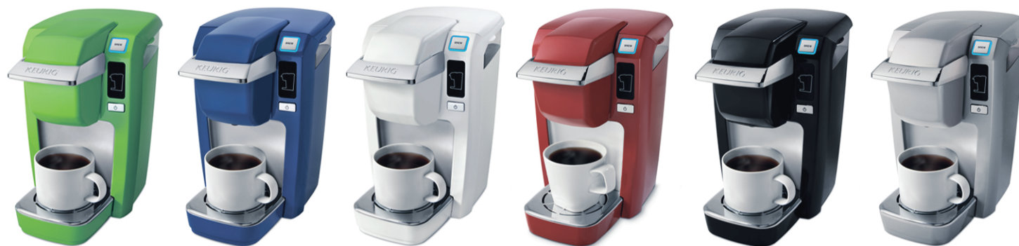
Keurig® B31 Mini Plus

Choose from 6 different Keurig brewer models and 7 colours!