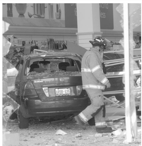
A different kind of door crusher special at the Winners/HomeSense store