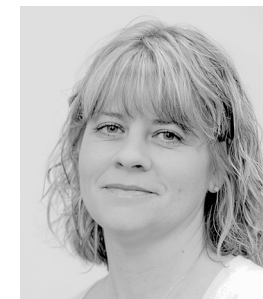
KRISTIE PELL'S REAL ESTATE