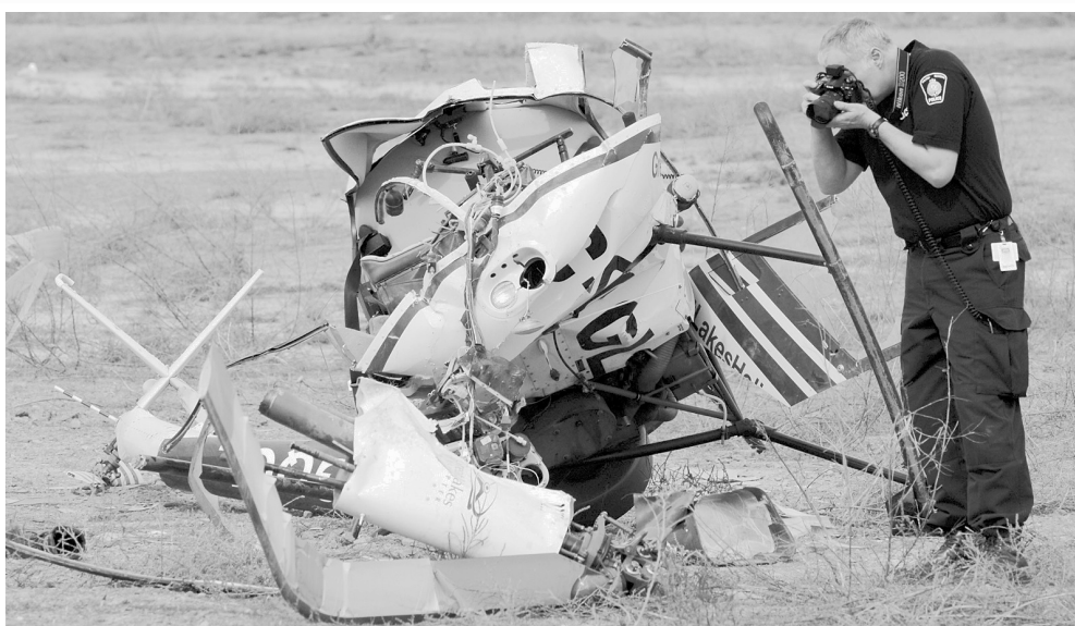
The instructor and student pilot suffered serious injuries in this helicopter crash

• Mayor Rick Bonnette tells a rep for a group of developers at a council meeting who propose the construction of their projects would be dependent on a lake-based "Big Pipe" system that could increase the population of Halton Hills by as much as 32,000 that the Town must not expand "like Brampton."