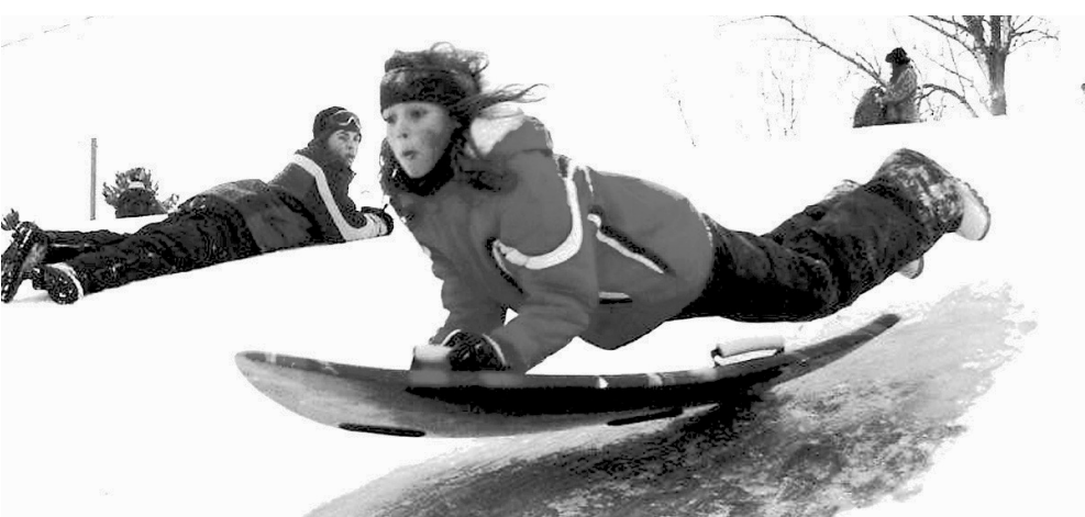
Making a run for it at the Cedarvale toboggan hill