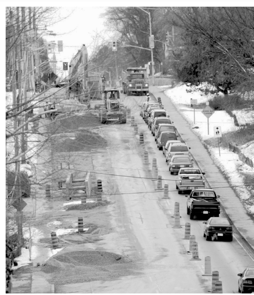
Ugh! Maple Ave. construction