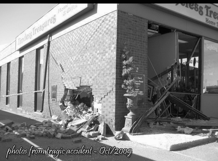
photos from tragic accident - Oct/2009

PROUDLY SERVING GEORGETOWN & SURROUNDING AREAS FOR OVER 20 YEARS