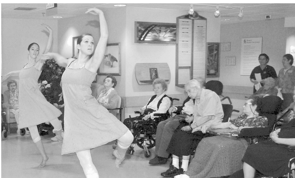
Halton Hills School of Dance performers entertain seniors