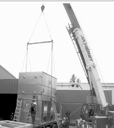
Cool: A new refrigeration unit is delivered to Mold-Master SportsPlex