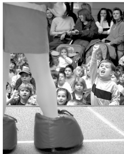
Right: A youngster cheers on cartoon character Noddy during a March Break event at the Georgetown Market Place