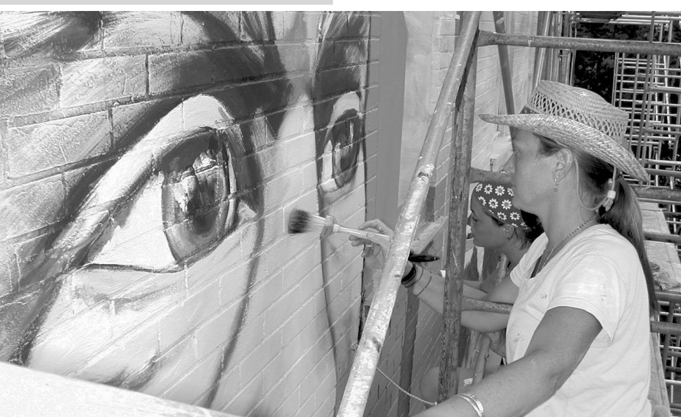
Left: Getting an eyeful while painting a mural downtown