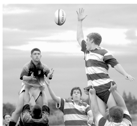
Below: North Halton rugby action