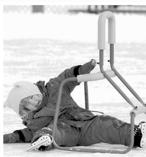
Learning to skate can be a challenge