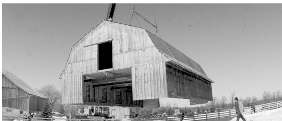
Raising the roof during a barn move