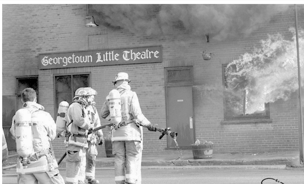
(Left) Firefighters battle a blaze at the Georgetown Little Theatre in Stewarttown which destroyed the GLT's extensive costume collection. (Below) The fire's aftermath

The Kings National Baton Club won the gold medal in the 48th Annual World Baton Twirling Championships in Indiana in August.