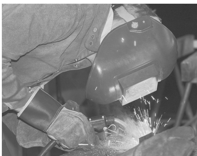
Sparks fly at the Georgetown District High School Tech Olympics