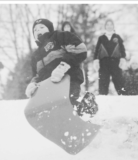
Flying high at the Cedarvale Park toboggan run