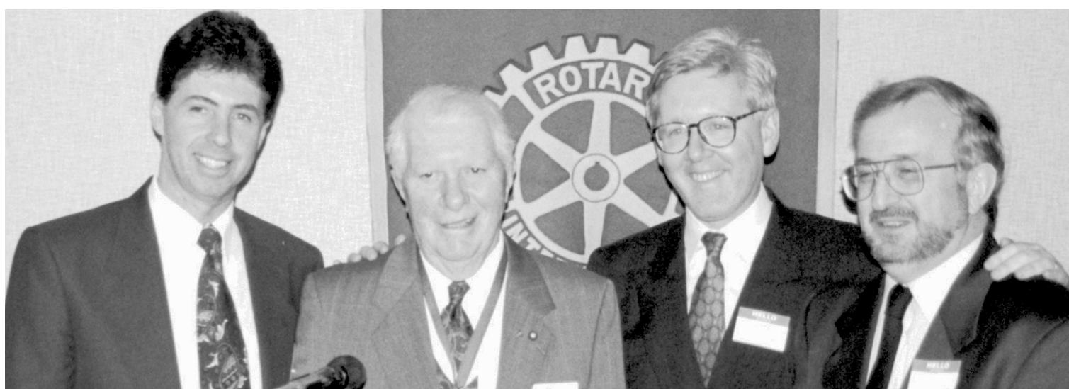
Then-Ontario Premier Bob Rae (second from right) addresses the Georgetown Rotary Club