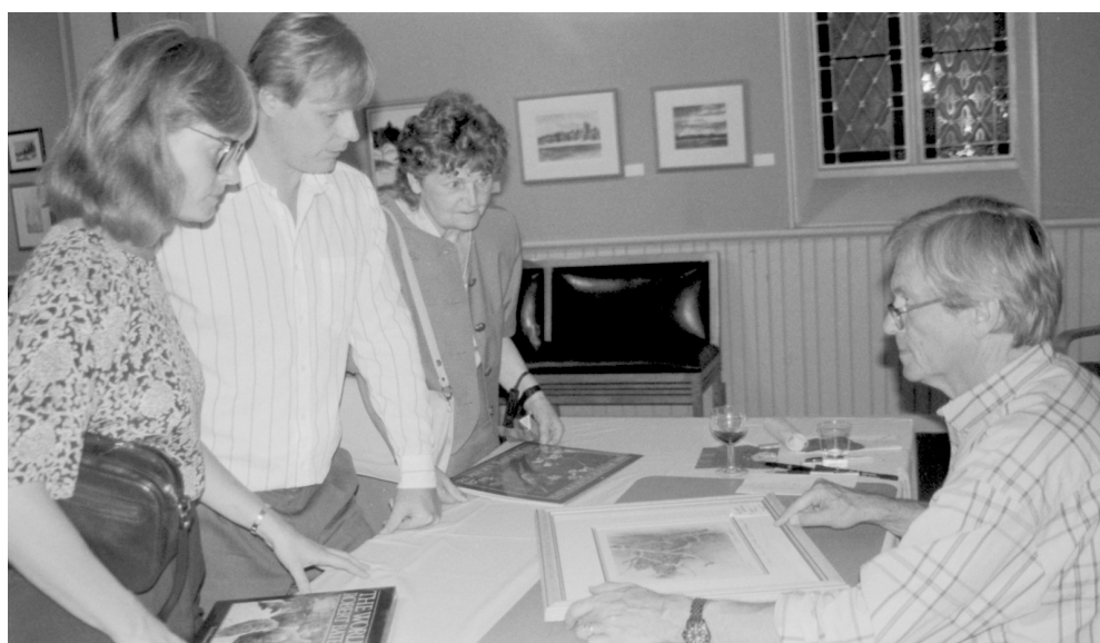
Sharing an evening with artist Robert Bateman (left)