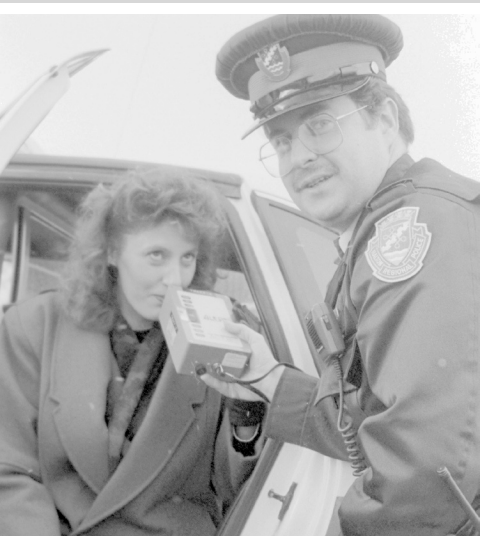
Promoting the annual Halton Police RIDE campaign

• In what observers deemed a miracle effort, Halton Leaver Hurricane pee-wees accomplished what no other Canadian team has done—they defeated the powerful Kharkov all-star team from Russia enroute to the winning the Richmond Hill/Vaughan Hockey Tournament.