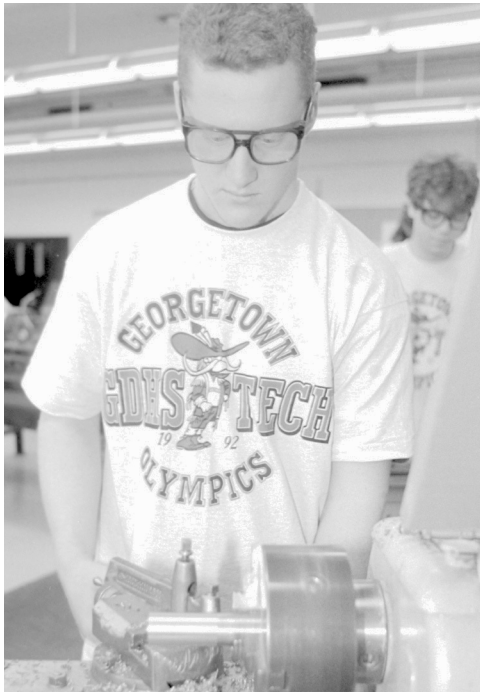
Competing in the GDHS tech Olympics