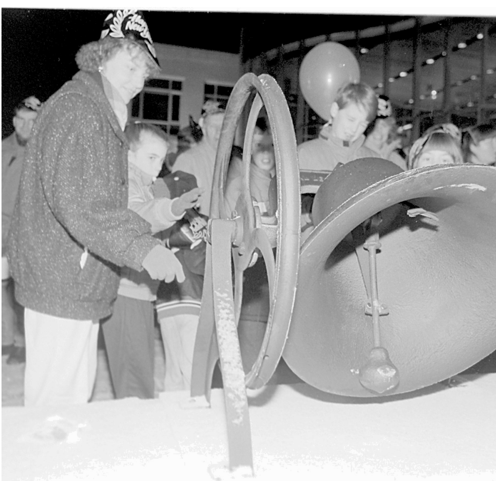
Ring in the new year at the Civic Centre