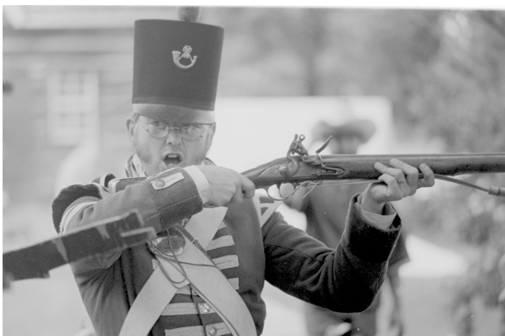
Re-enacting the War of 1812 at Halton Heritage Museum