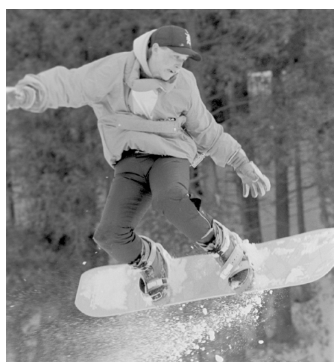
Snow boarding at North Halton Golf Club