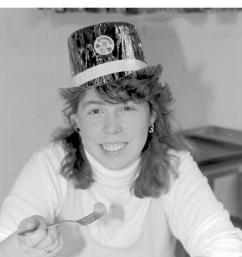
Enjoying Irish stew on St. Patrick's Day at St. John's Church