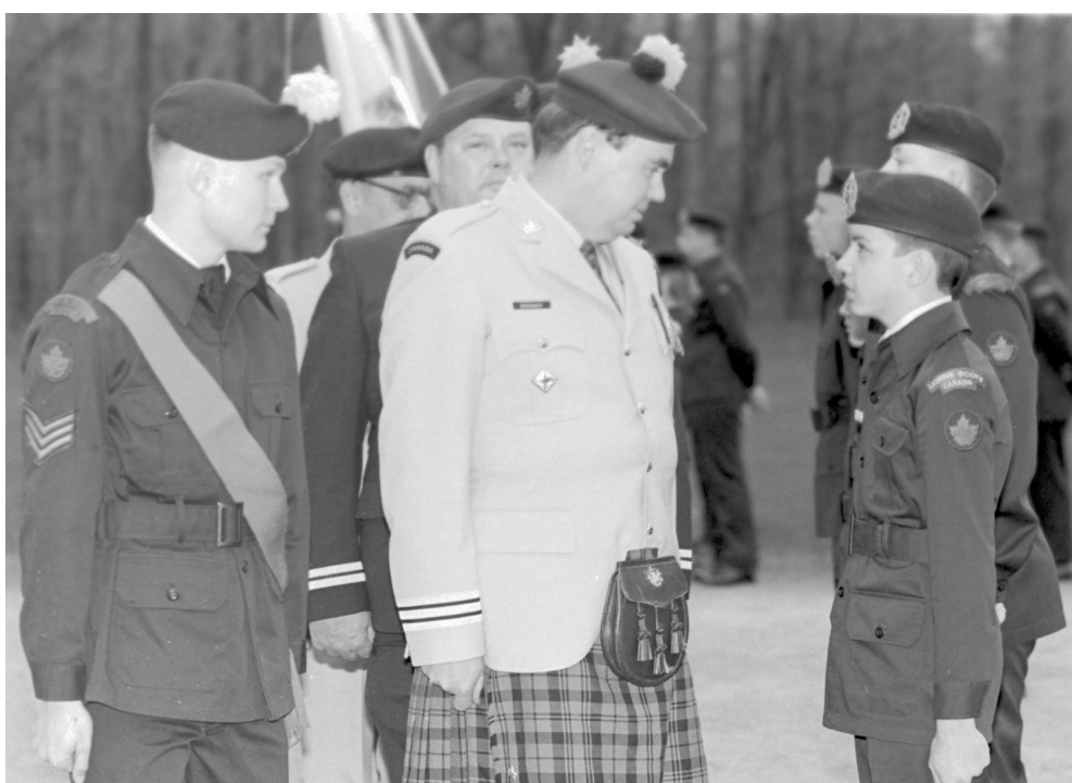
Eyes front at a Lorne Scots inspection