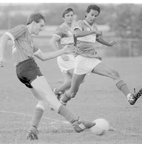
Georgetown Falcons take on Erin Mills Flyers in soccer action

• In December, the final agreement between the Town, Region and developer Halton Hills Village Homes paved the way for a 417-home subdivision—the first of the Georgetown south development.