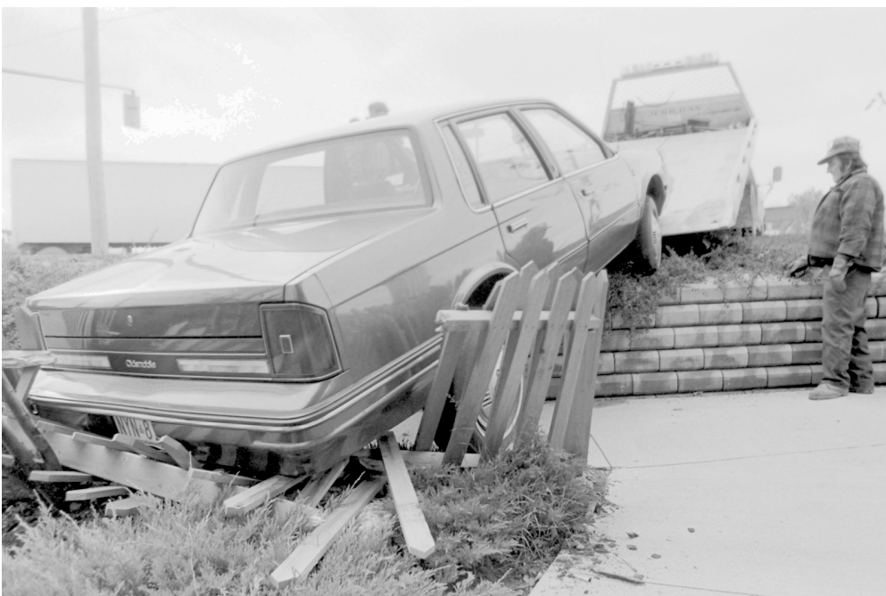
A poor parking job at Bellamy's Restaurant

• A CN train, pulling eight burning cars, left a trail of 11 grass fires. The Fire Department needed every man and every piece of equipment to put out the fires.