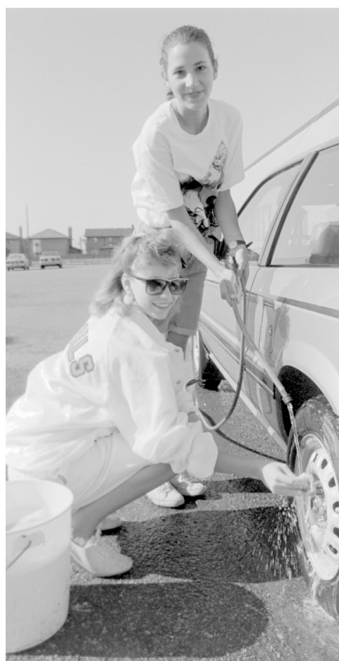
Mecca car wash for Cystic Fibrosis