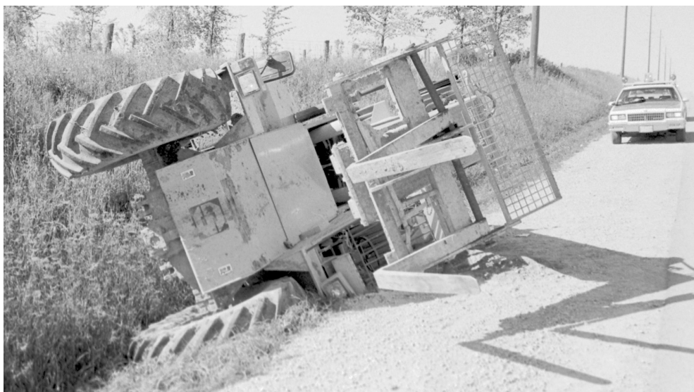
An industrial loader accident on Trafalgar Road