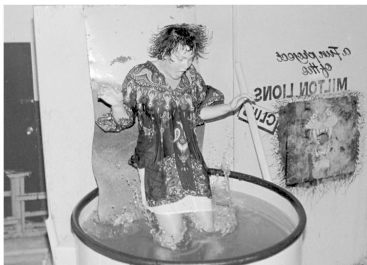
Going for a dip in the dunk tank at a Recreation Department carnival