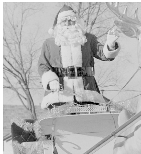
Santa Claus rides high. He hasn't changed in all these years