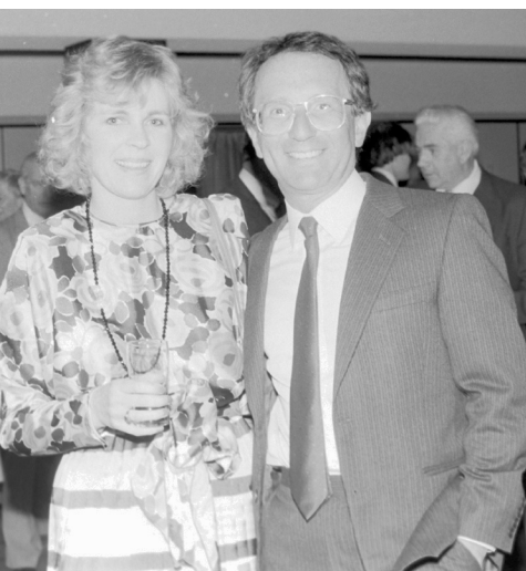
One-time Ontario Tory leader Larry Grossman pays a visit