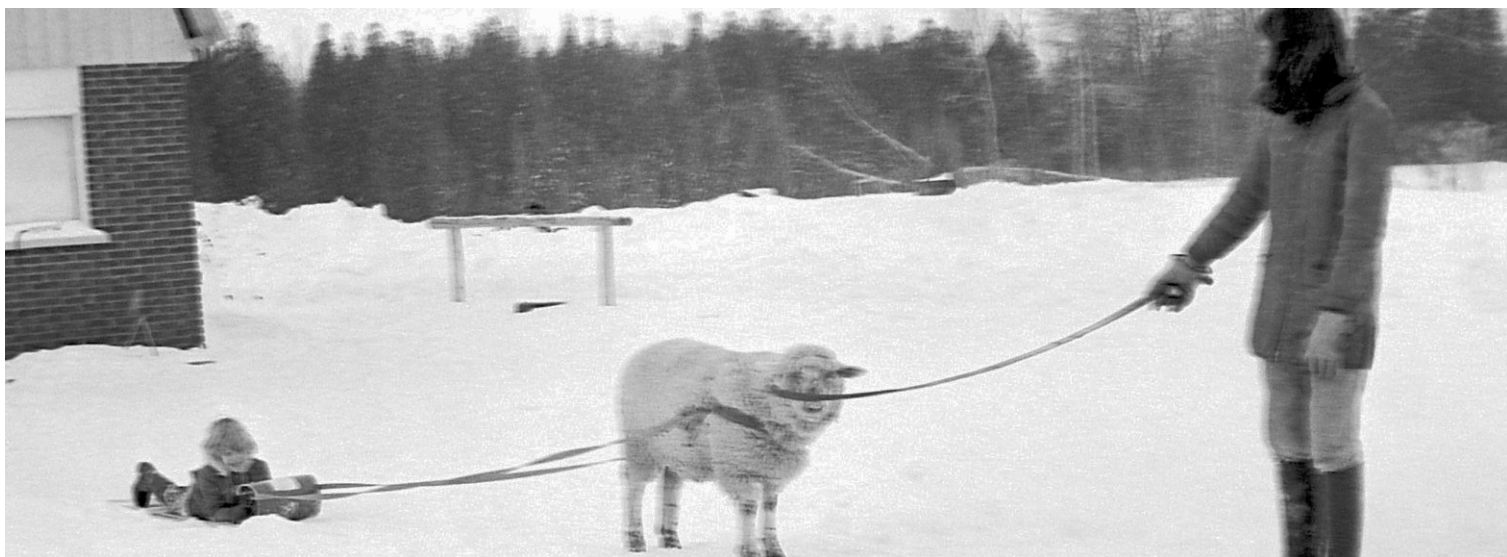
A sheep is put to work pulling a sleigh (and youngster)