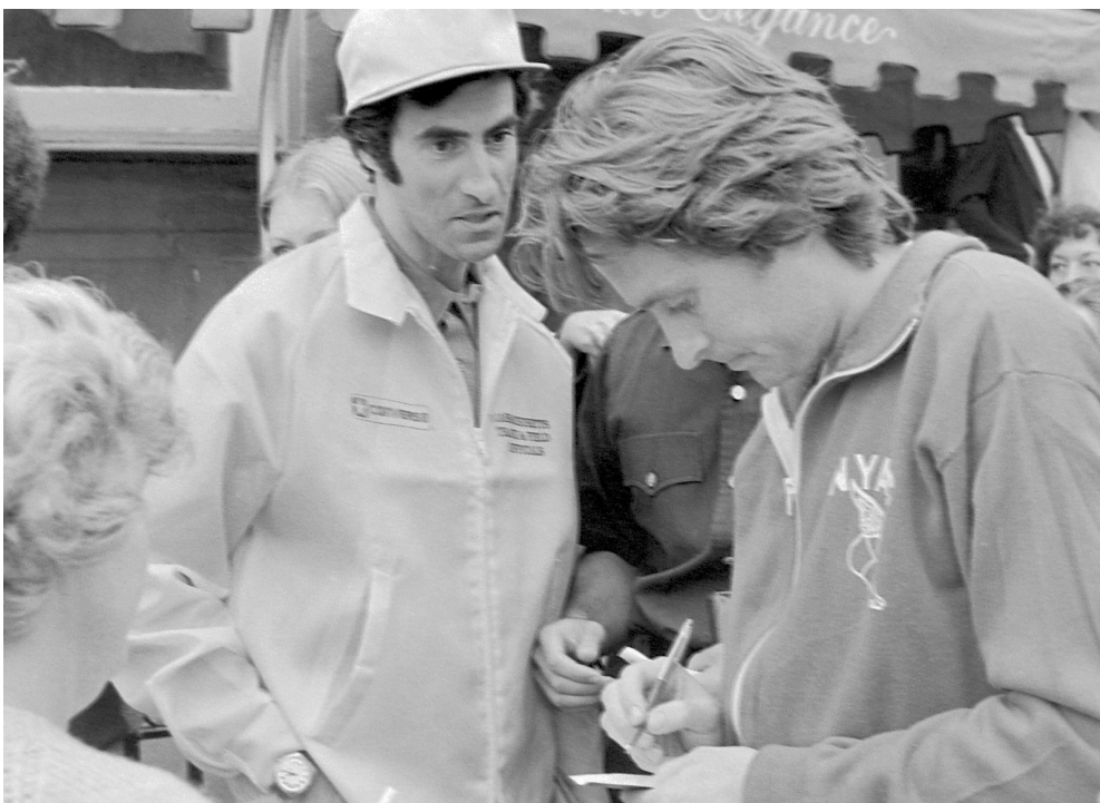
Actor Michael Douglas signs autographs (above) and gets to work on the set of 'Running' which was filmed in downtown Georgetown