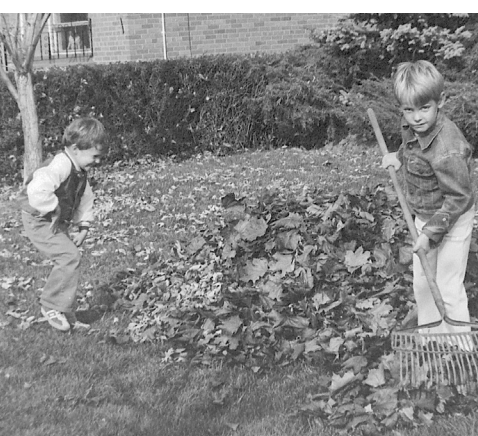
It was a balmy fall as these youngsters were caught raking leaves in mid-November