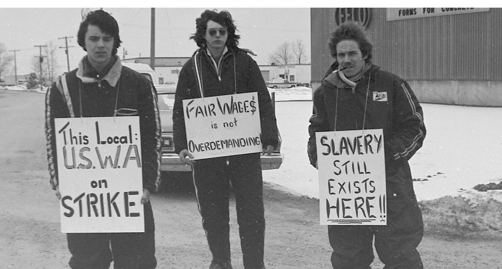
EGCO strikers march the picket line in March

• In July it was reported that more than 200 people signed a petition to stop construction of a $900,000 addition to the Esquering municipal building on Seventh Line. Later in July it was reported the expansion plan was going down the drain since the majority of councillors no longer supported it.