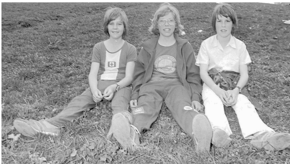
Taking a break from a walk-a-thon