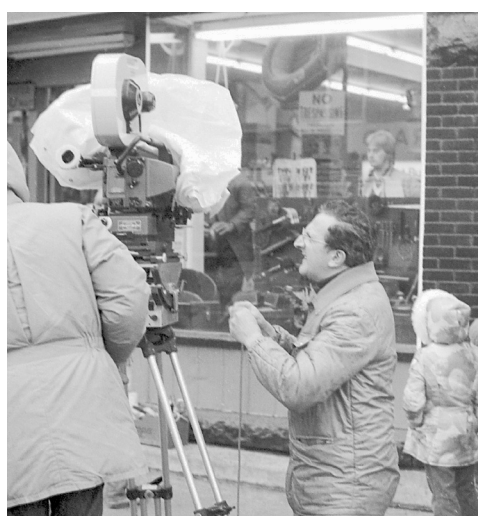
Filming for the 1977 movie Equus (left) was done in downtown Georgetown. The movie starred Richard Burton (below) the former husband (twice) of Elizabeth Taylor