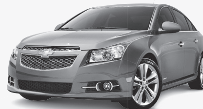
CRUZE LTZ SHOWN**