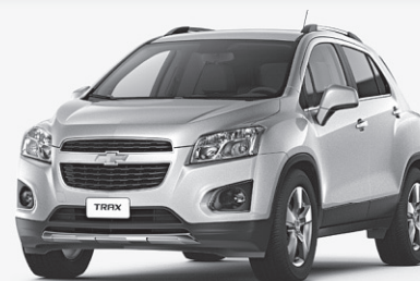
TRAX LTZ SHOWN**