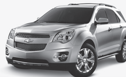
EQUINOX FWD LTZ SHOWN**