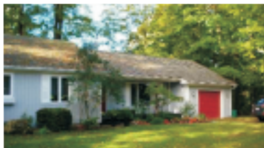
HILLTOP BEAUTY $419,000