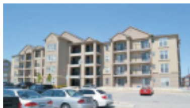
ONE BEDROOM UNIT IN MILTON $238,900