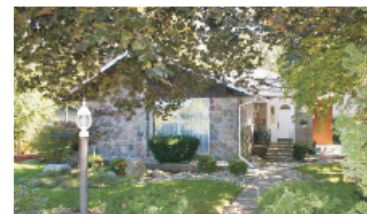
CHARMING BUNGALOW-QUAINT VILLAGE OF NORVAL $699,900