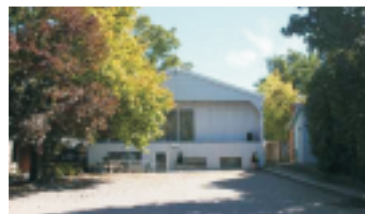
DO NOT MISS THIS OPPORTUNITY!! $799,900