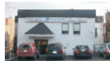
COMMERCIAL UNITS AVAILABLE $670/Month