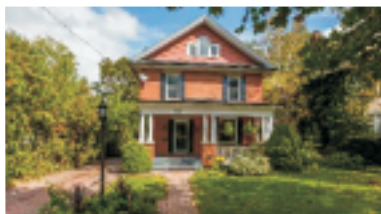
GRACIOUS 3 STOREY IN THE PARK AREA $684,900