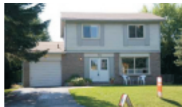
4 BEDROOM FAMILY HOME IN HILLSBURGH $388,700