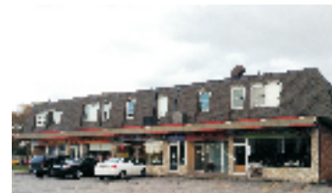
FOUR UPPER LEVEL COMMERCIAL LEASES $10 to $12/Sq.Ft. Net