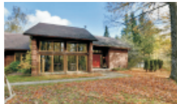
COUNTRY HOME ON 10 ACRES OF NATURES BEAUTY $799,900