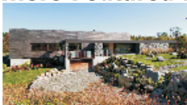
SECLUDED MODERN COUNTRY $3,500,000