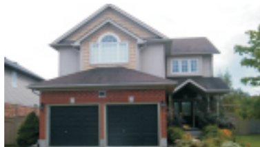
STUNNING HOME & VIEWS IN ORANGEVILLE $488,000