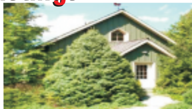
RURAL RETREAT OVERLOOKING THE POND $1,650/Month