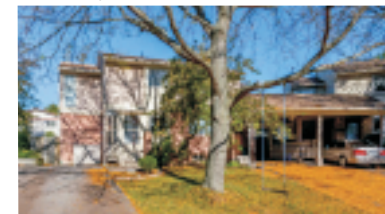
3 BDRM, 2 BATH WITH WALKOUT TO YARD $359,900