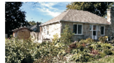
GLEN WILLIAMS CHARMER! $369,900