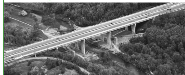
Sixteen Mile Creek Bridge and six-lane widening on Dundas Street (Neyagawa Boulevard to Proudfoot Trail) in the Town of Oakville