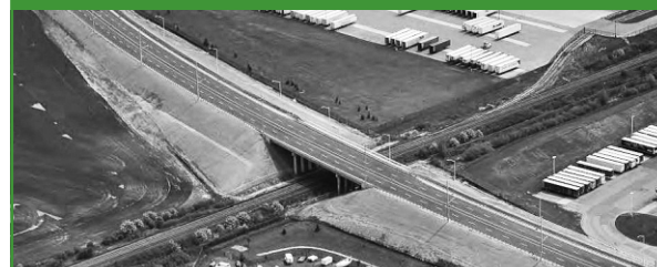
New four-lane James Snow Parkway extension (Regional Road 25 to Steeles Avenue) including new railway overpass in the Town of Milton