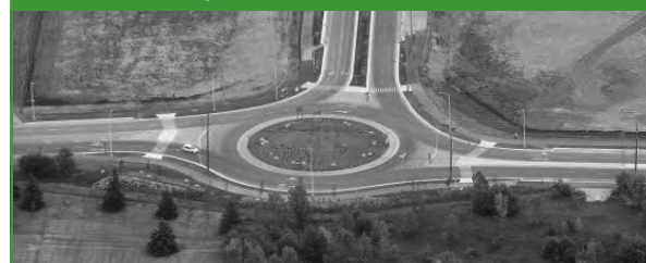
New Tremaine Road roundabout (looking east along Main Street) in the Town of Milton