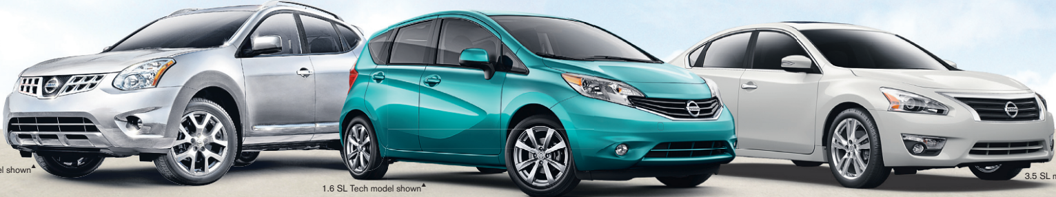
SL AWD model shown*