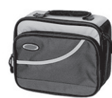
Reusable lunch bag