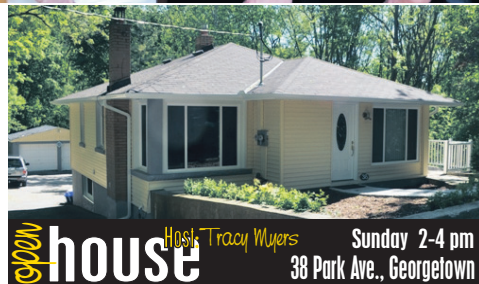
Open House Host: Tracy Myers Sunday 2-4 pm 38 Park Ave., Georgetown

Country Setting - Downtown Georgetown Tall trees furnish a screen of privacy around this ~1/2 acre property-with the gentle sounds of the river! Set in the midst of this serenity is a gorgeous bungalow that enjoys nature's vistas from every room. The renovated 3 bedroom (can be reconfigured back to 4 bedroom), 2 bath home is designed for comfortable living and has all the amenities one could wish for, including a gorgeous eat-in Kitchen, formal Living/Dining, home office, finished W/O basement (possible inlaw suite), and detached double garage. Just a short walk to downtown Georgetown, shops, restaurants, parks & theater. If there ever was a "must see" this is it!