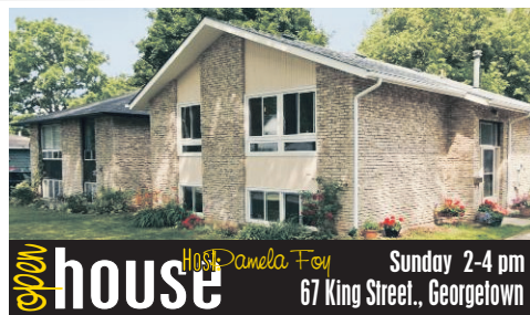
Open House Host: Danella Foy Sunday 2-4 pm 67 King Street., Georgetown

Wall to Wall Income! Don't let this great investment opportunity pass you by. Raised bungalow with 2 self contained units located close to Go transit and shopping, making it the perfect rental property! Main level unit offers an open concept layout with good sized Living Room with broadloom and large windows, Dining Area, full Kitchen, 3 bedrooms and 4 piece bath. The lower unit level offers open concept layout - Living Room with Broadloom and Above Ground windows, eat-in Kitchen, 2 bedrooms and 4 piece bath. There is a 2 car garage and private drive with parking for 6 plus cars. Updates - Roof ~2009, Furnace ~2006, Windows ~2011, New Garage ~2000.