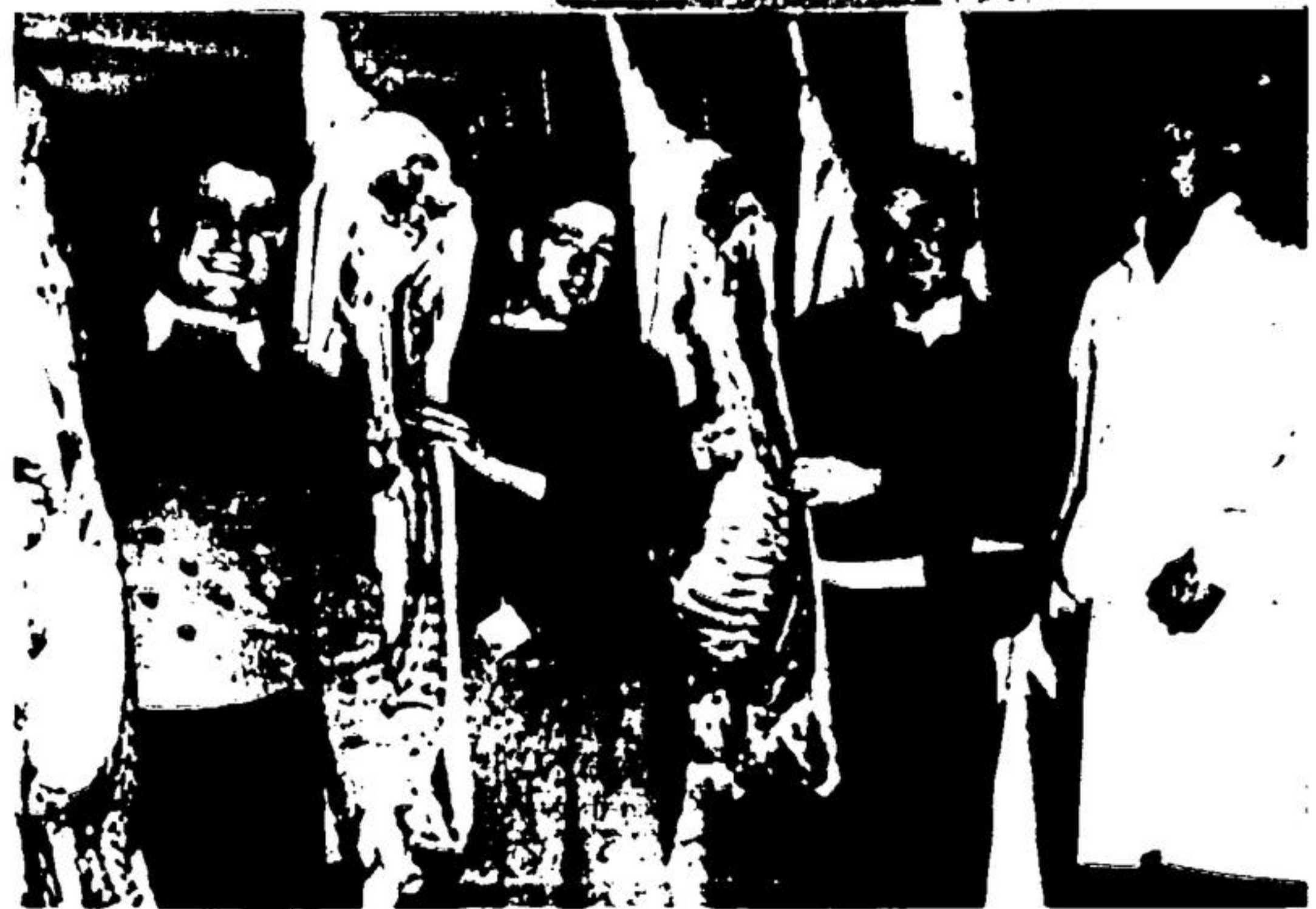
The display shows the Acton Junior Farmers group prize winning display at the Annual West Hill and Barton Fair in Acton, Ontario. The group is seen in judging competition.