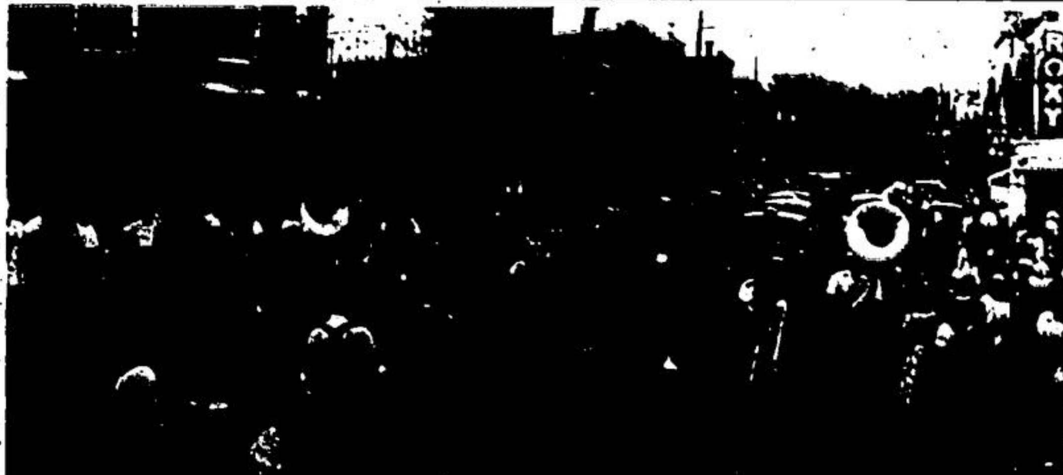
Ten bands entertain at Acton's largest gathering of musicians. The event, sponsored by the Acton Boys' and Girls' Band, entertained 2000 people.