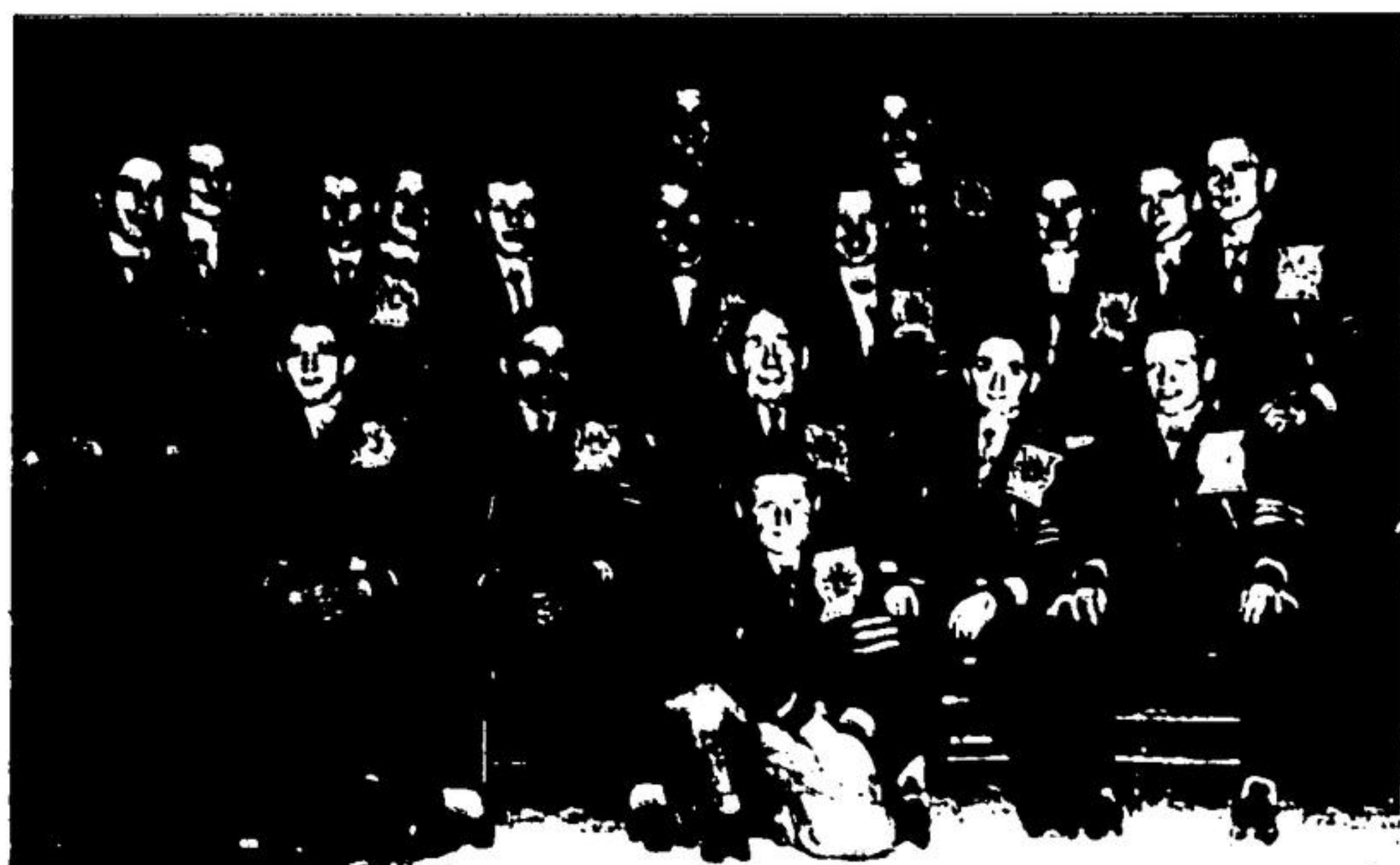
Acton Junior Hockey Team received new jackets from an appreciative Town, Fair and Athletic Association. The team was eliminated by the Orono Junior Champions in the semi-finals.