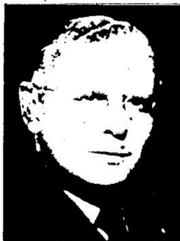
Premier Leslie M. Frost, P.C., made a brief stop in Acton early one morning while on a western trip.