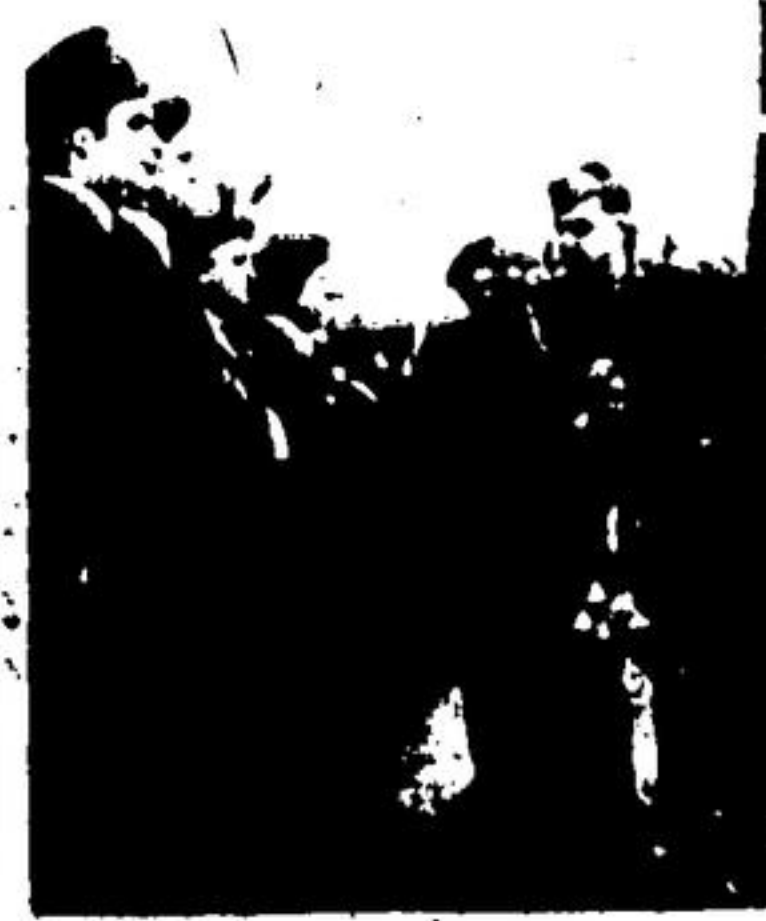
Ontario's Lieut. Governor visits Acton on Remembrance Day and unveils the new additions to the Soldier's War Memorial. The Lieut. Governor and his party, along with officials and others were entertained at a civic reception in the Y.M.C.A. following the service in the United Church.