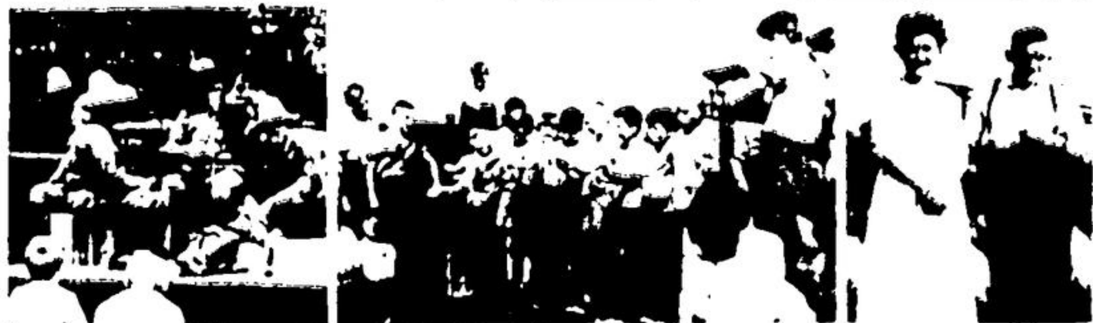
The Rotary program on July 1 appealed to all ages. Winners, contestants and entertainers were caught by the Free Press camera.