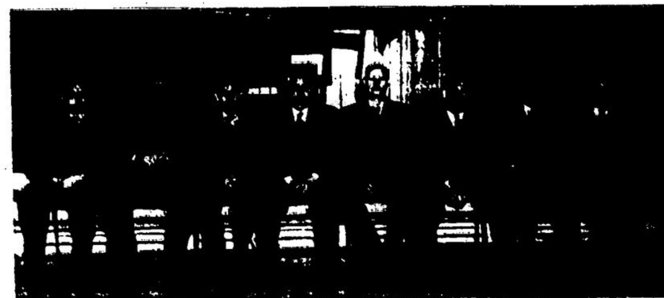
Nassagaweya holds its 100th Anniversary. Above are some of the reeves who have served the Township in its 100 years of growth.