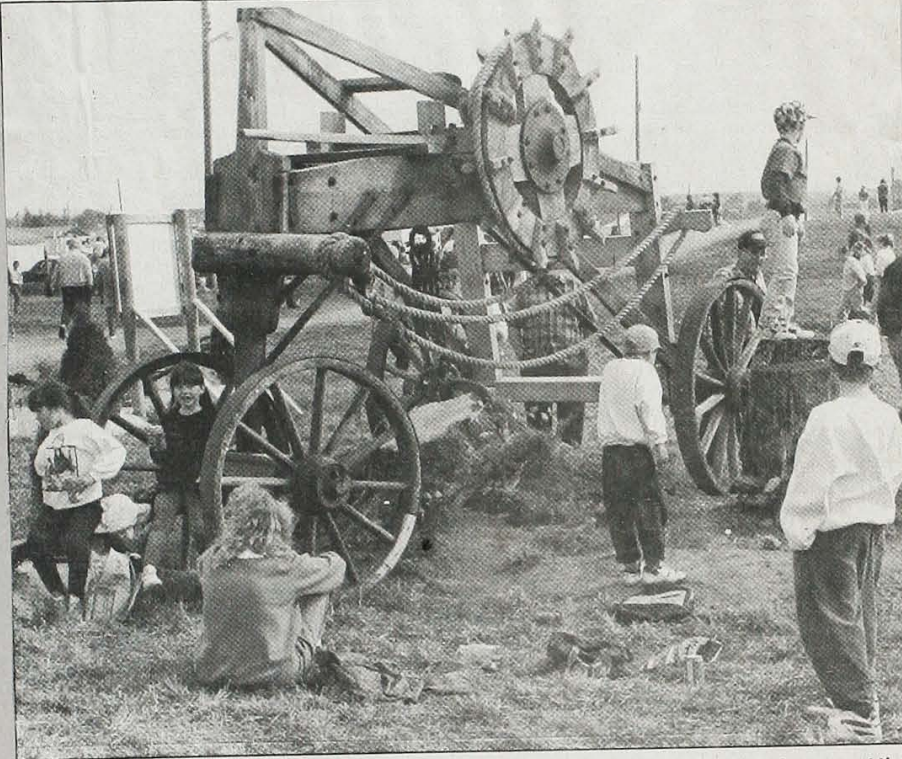
ST. ANTHONY'S School in Kincardine spent Wednesday at the IPM. The Grade 4 class spent the lunch break at the Bruce County Museum's stump puller.