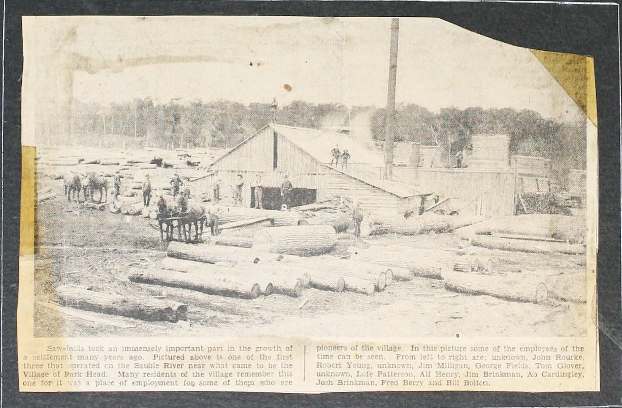
Saw-mills took an immensely important part in the growth of a settlement many years ago. Pictured above is one of the first three that operated on the Sauble River near what came to be the Village of Park Head. Many residents of the village remember this one for it was a place of employment for some of them who are