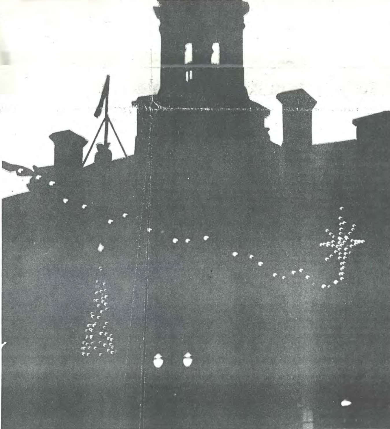
CHRISTMAS IN COBOURG .... Last night as the lights came on and the evening sky darkened, the town's old landmark, Victoria Hall, stood watch over its 111th Christmas season. This year, the

Old Vic received a Merry Christmas present itself, a federal grant of $19,000 to start the first preliminary work on its restoration as a major Canadian historical monument.