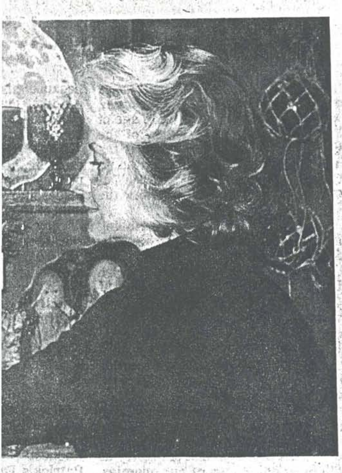
nusband is the pharmacist at Krauman's drug store.

and the same with the know the ingredients of a product or how it works." When it comes to beauty, chemistry at university, I find there is a close connection when I want to physically.