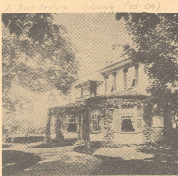
The Poplars - 1894