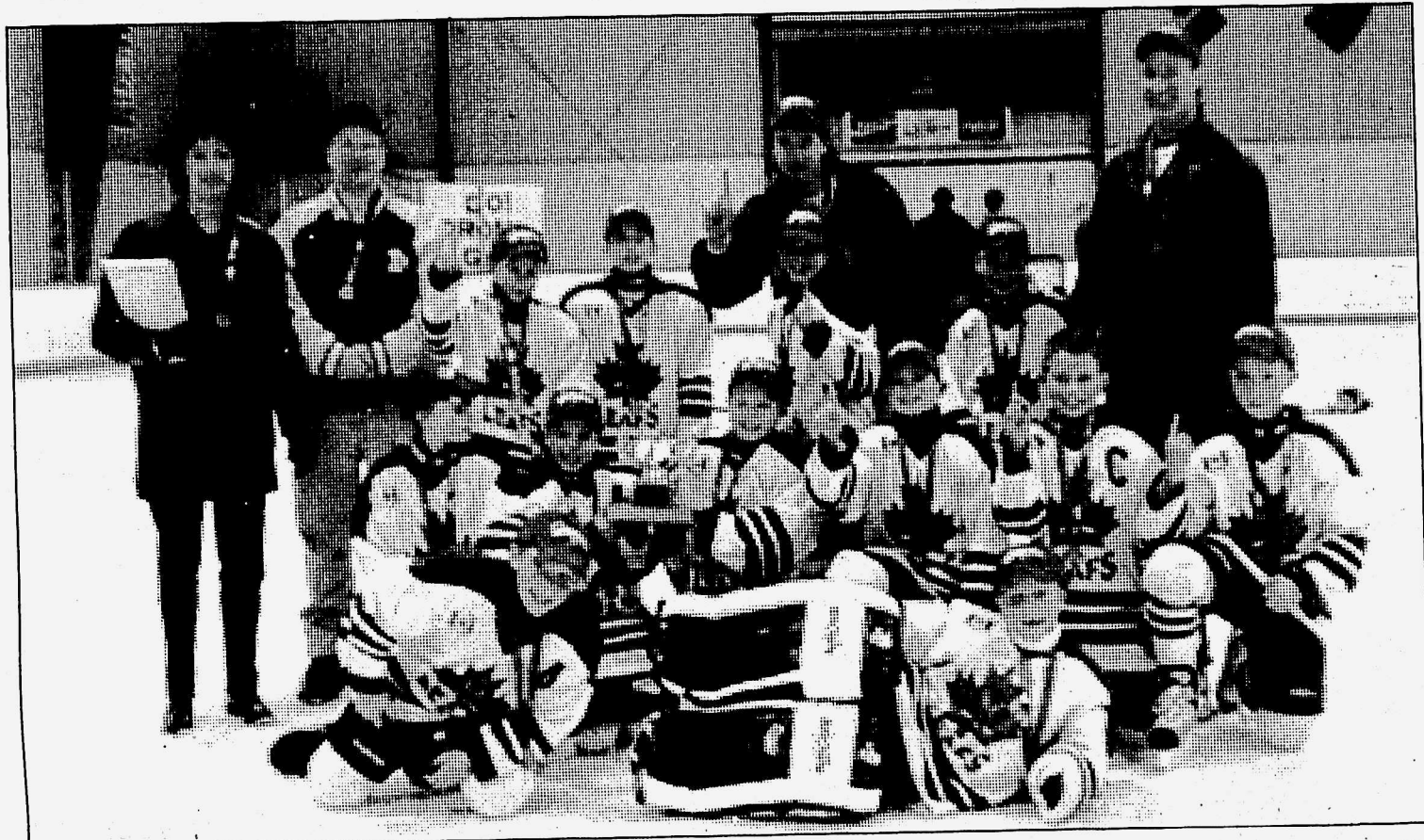
Orono Novice Reps celebrate after winning the Ontario Minor Hockey Association Novice D Red Lobster Cup on Sunday.