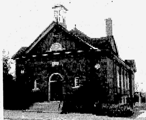
Orono Town Hall