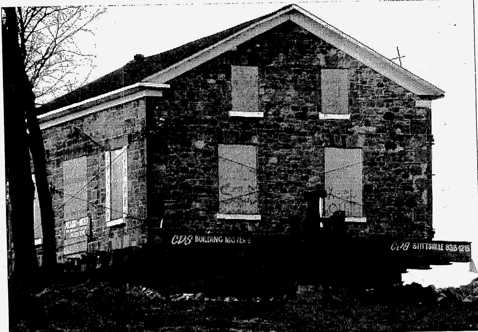
The John Colé House at 5690 Acres Road is ready to move to its new location on Bethesda Road south of Taunton once the weather co-operates.

Bill and Zane were quite pleasant and I was happy to help them out. Our plan for the future is to make both contests North American events!