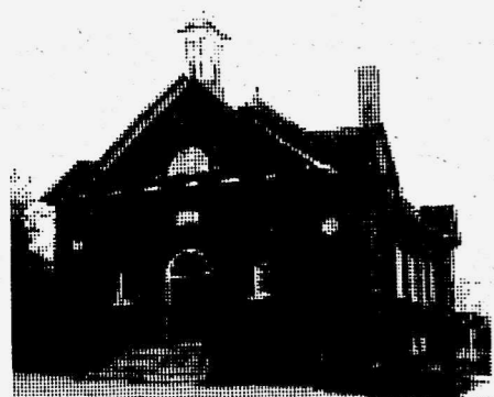
Orono Town Hall