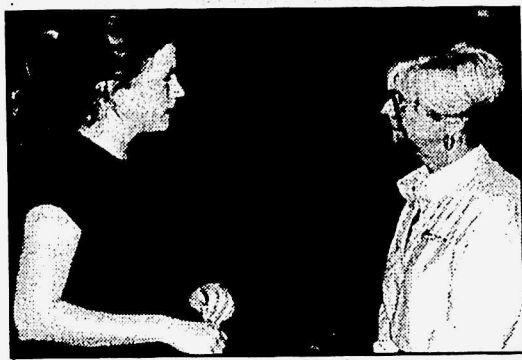
Talk about the environment at Expo 03

alternative would see approximately 100,000 cubic metres of waste in the East Gorge area relocated in an engineered above ground mound on the existing site and the balance of the waste managed in place with the multi-component cover system and on-going groundwater collection and treatment.