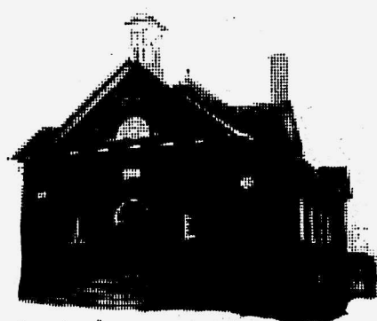
Orono Town Hall