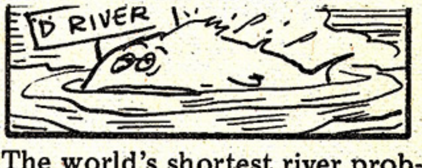
The world's shortest river probably has the shortest name. It's the 440 foot D River in Oregon.