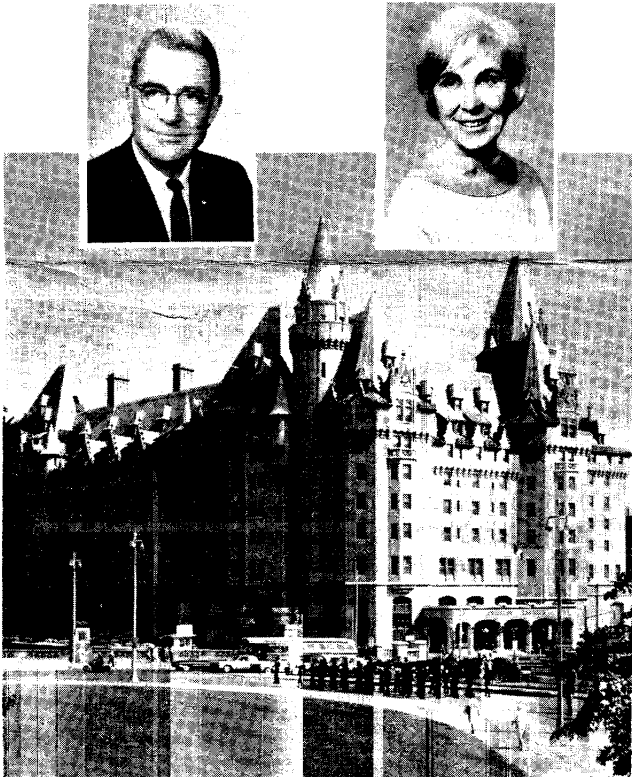
CHATEAU LAURIER – OTTAWA

On suggère fortement l'organisation de voyages par autobus, car les arrangements ont été pris pour que ces mêmes autobus puissent faire le tour de la ville d'Ottawa, afin de visiter l'exposition de tulipes qui se tient à travers toute la ville. Les clubs d'Ottawa auront des Kiwaniens à notre disposition pour cette occasion.