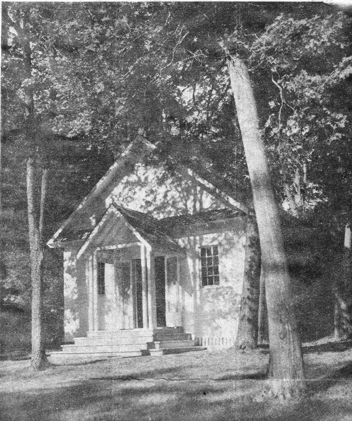
This picture of the Pleasant Point Union Church was taken on Sunday, the 46th anniversary of its founding.